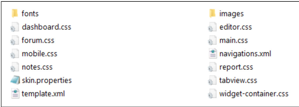
Folders and files comprising a skin

Fonts and images referenced from the stylesheets must be included in the corresponding folders in the skin package. Skin designers are free to define a bespoke sub-folder structure, so long as they are correctly referenced from the other files.